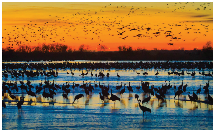
Sandhill Cranes converge upon the Platte River

But wait, there's more! Much more! The conference also includes workshops, educational exhibits, live and silent auctions, a raffle, vendors and fun socializing with new and old birding friends. Dinners on Friday