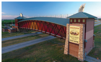
The Prairie Culture tour includes a stop at the Archway monument and museum.

Lunch for both field trips will be at Burchell's White Hill Farmhouse Inn ( burchellfarmhouseinn.com ).