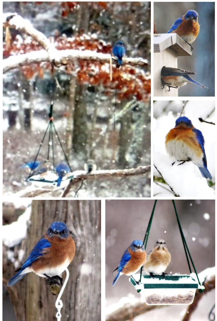
Bluebirds are no weaklings, that’s for sure! These photos were taken this past winter (and after March 21st’s snowfall!).