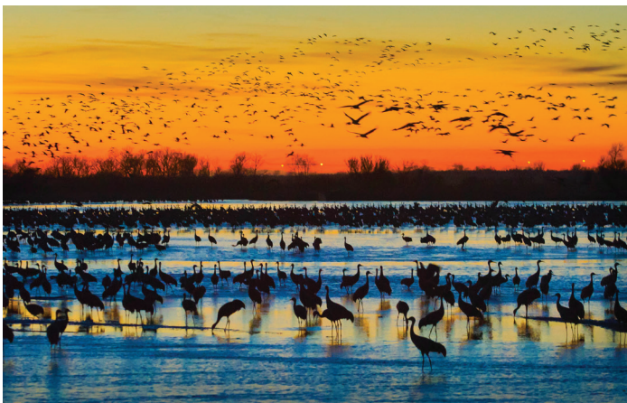
Sandhill Cranes converge upon the Platte River