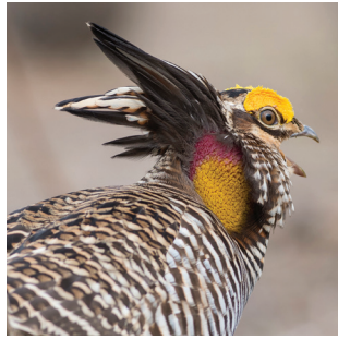
The birding field trip includes viewing Prairie Chickens.

The Prairie Culture tour will include stops at: