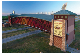
The Prairie Culture tour includes a stop at the Archway monument and museum.

Lunch for both field trips will be at Burchell's White Hill Farmhouse Inn ( burchellfarmhouseinn.com ).